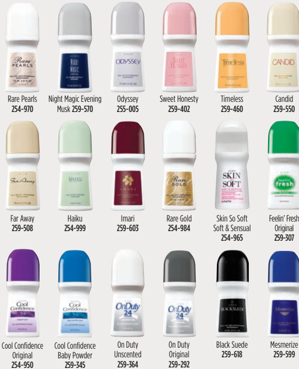
Rare Pearls 254-970 Night Magic Evening Musk 259-570 Odyssey 255-005 Sweet Honesty 259-402 Timeless 259-460 Candid 259-550 Far Away 259-508 Haiku 254-999 Imari 259-603 Rare Gold 254-984 Skin So Soft Soft & Sensual 254-965 Feelin' Fresh Original 259-307 Cool Confidence Original 254-950 Cool Confidence Baby Powder 259-345 On Duty Unscented 259-364 On Duty Original 259-292 Black Suede 259-618 Mesmerize 259-599 Wild Country 259-489

Brochure Price: $2.69 each Your Cost: $1.34 each