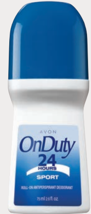
On Duty Sport 259-330